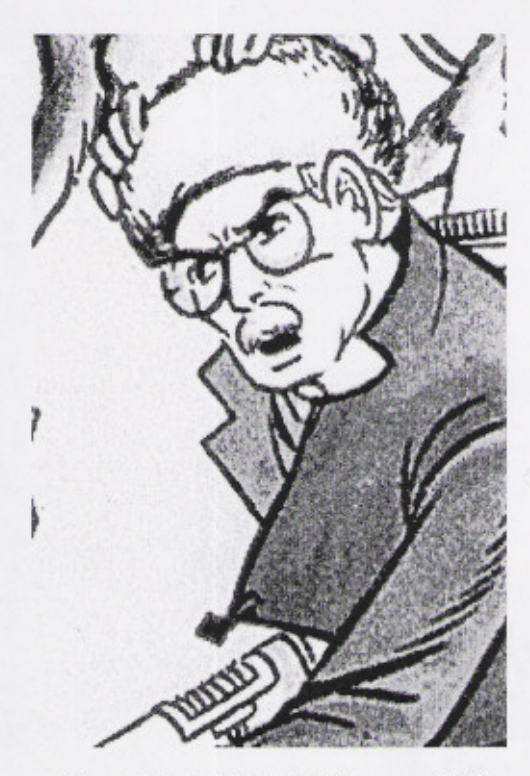
Figure 2: Uncle Choi by Hui Gwun-wan, 1958

comics. Examples can be seen in "Uncle Choi" (Figure 2) by Hui Gwunwan, first published in 1958, and "Master Q" (Figure 3) by Wong Chak, first published in 1965 (Wong and Yeung 1999). The arrival of 13-Dot provided a new artistic direction to the local comics at that time, and went along with the rising youth culture of Western popular music and movies. Such an environment boosted the popularity of the comics, especially those created with new drawing style and story line different from the existing ones in the 1950s.