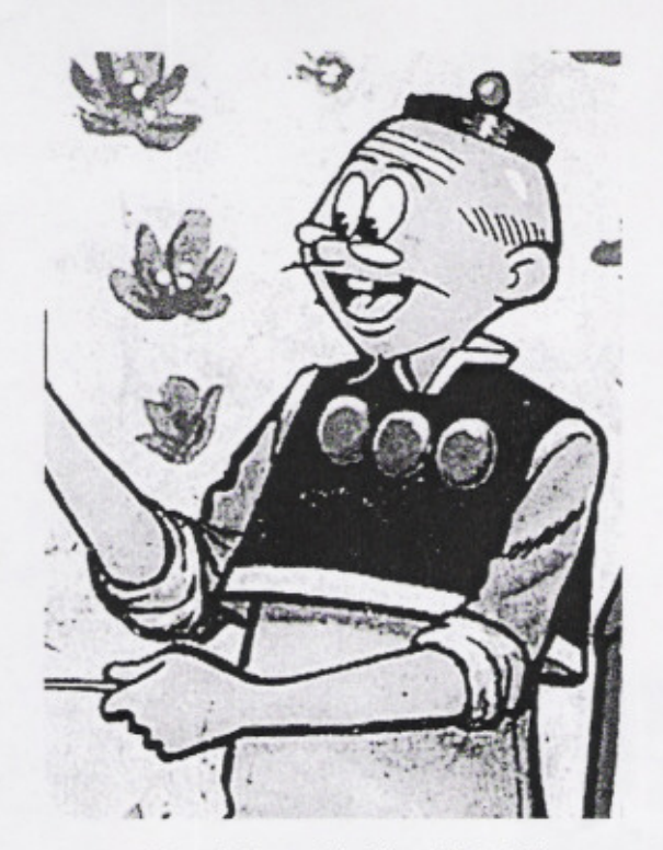
Figure 3: Master Q by Wong Chak, 1964

the identical image shown on front and back. Usually the cover carried some association with the theme of the story within that issue. For example, if the issue was released around Chinese New Year, the cover would likely incorporate elements related to this holiday. Summer issues might include beach or vacation themes.