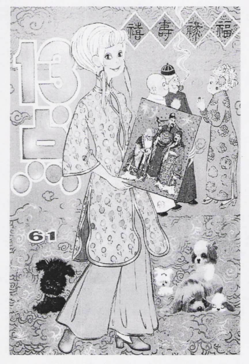
Figure 6: Cover of 13-Dot Cartoons issue #61, 1970.