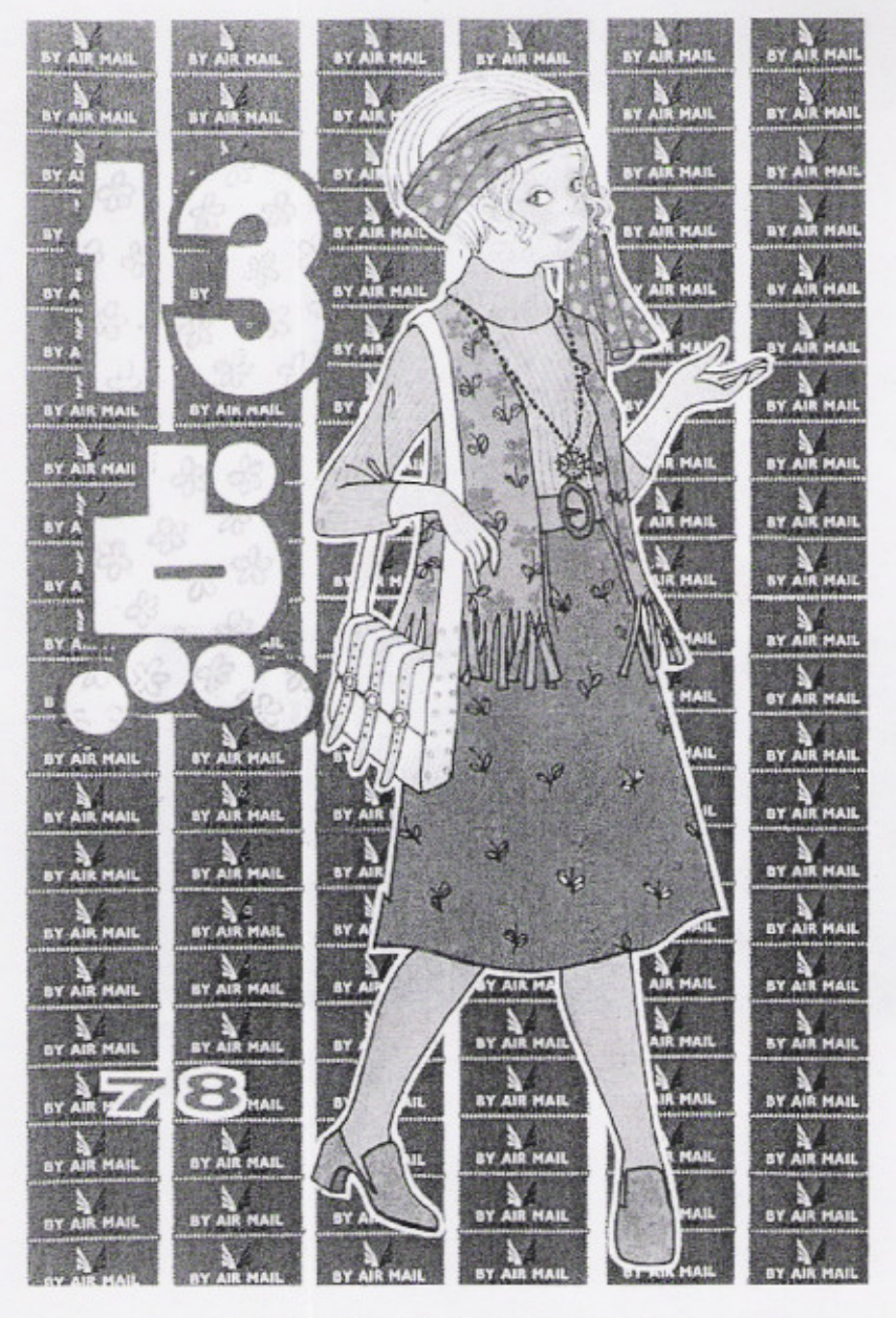
Figure 8: Cover of 13-Dot Cartoons issue #78, 1970.