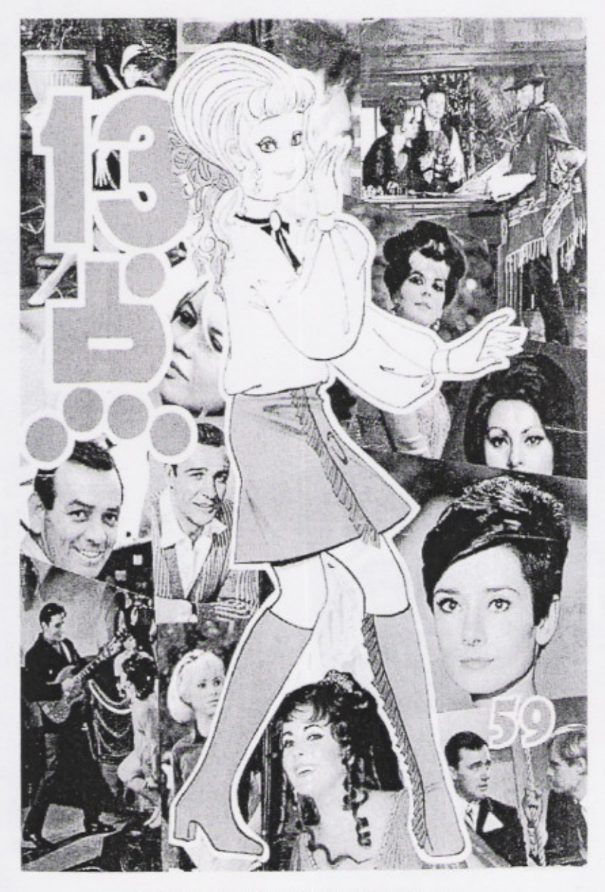
Figure 7: Cover of 13-Dot Cartoons issue #59, 1970.