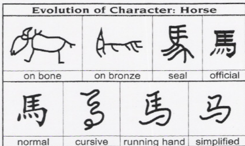
Figure 1. Evolution of Characters

Also, the structure of Chinese characters marked its own typographic design system. Chinese characters are constructed from basic units of "strokes" which are composed of dots, lines, and hooks. They are designed to fit into an imaginary square. A simple character can appear as an independent character as well as a component element in compound or multi-element characters (figure 2).