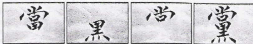
Figure 7. Client - Chen-Li-on and Wang Ching-fung

other with the presence of the non-stop male voice over. It opens up with giving out the problem of the society, "hei" (the arrival of the darkness), then the suggestion of taking a closer look, "shang" (let's), at the problem of "hei" (the dark side of the society). Then when these two characters, "shang" and "hei" combine into one character which becomes "dang," (a political party).