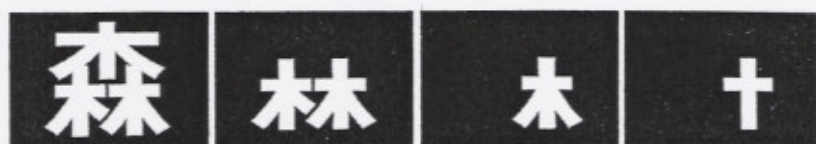
Figure 5. Client - Friends of the Earth (Hong Kong)

Throughout the ad (figure 5), we can see that it follows the classic golden rules from modern design theory; "form follows function" and "less is more." The "form" in this case consists of the creative combining of abstract images of Chinese characters first starting with "sen" (forest), then "lin" (double wood), "mu" (wood), and finally the form of a "cross" (Christian's symbol) to signify death. The appearance of each form is deconstructing from one original multi-element character. In this case, "sen" (forest) is composed by three characters of "mu" (wood).