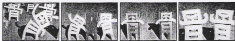
Figure 4. Client - Benefits Kidney and Bones Nutritive Juice (China)

figures" to signify the daily activities of human beings and the importance of bone to the health of a person. The creator cleverly adopts the basic principle of Chinese characters, "pictographs" (xiangxing) in this case turning the type into a visual image with self-explained contents and meanings. As the story develops, the "bone breaking" and the presence of bandages on those animated typographic figures implies the "health problem." Then, a new Chinese character, "shen" - kidney is raised, superimposed and absorbed into the bone character. Soon the problem is settled, bringing out the real subject of the whole commercial, the product: "Benefit Kidney and Bones Nutritive Juice."