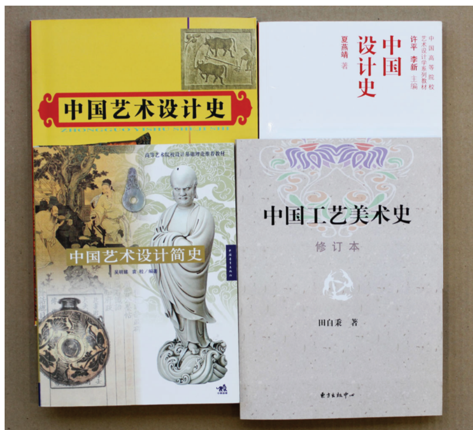
Fig 6. Samples of design history textbooks in China.