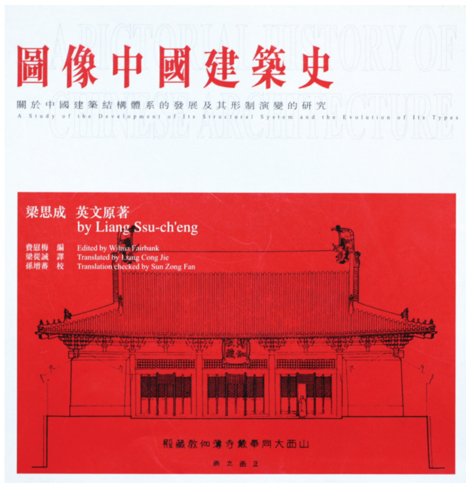
Fig 5. S. Liang, A Pictorial History of Chinese Architecture: A Study of the Development of its Structural System and the Evolution of its Types [Chinese version], Joint Publishing (HK), Hong Kong, 2001.

Seeing the increasing interaction of design activities and the shared civilization heritage between the three locales in the region, Wendy Siuyi Wong has published an overview