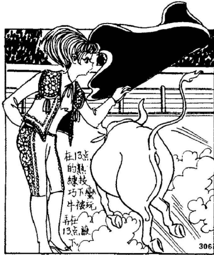
FIGURE 2. Miss 13-Dot becomes a bull-fighter, insert from 13-Dot Cartoons , issue #55, frame #306, 1969.

The outgoing and cheerful characters of 13-Dot Cartoons were considered as avant garde in the history of comics of Hong Kong. Indeed, 13-Dot Cartoons created by Lee in the mid-1960s were situated at the crossroads of the pressure of traditional values and new social expectations for women. This cartoon promulgated consumerism and was in some ways impractical and unrealistic. However, this comic to a certain extent did refuse to accept the assigned duty and stereotyped roles for women in the society of the 1960s, going beyond the traditional values to provide an image of new gender roles of women, and to construct positive women's images that accommodate the cultural and social changes in Hong Kong. With continued economic, educational and legal developments, the status and visibility of women increased and formed the improved situation of Hong Kong society in the 1970s and 1980s, and the 13-Dot Cartoons became less popular in the mid to late 1970s; they ceased in 1980. As experience with the workplace and higher education became more commonplace for Hong Kong's women, it is likely that the fantasy- and fashion-related themes of 13-Dot Cartoons became less and less relevant to the issues and concerns facing them.