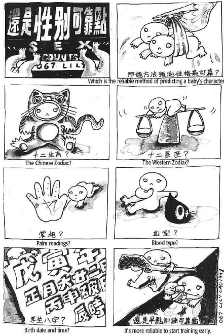
FIGURE 6. “Sex Counts,” by Lau Lee-lee (1998), p. 57.

sparked discussion of the ideology of feminism in Hong Kong. Her work contains enough ambiguity and subtlety that it may draw its audience partly from non-feminist readers as well. Whatever the reason, Lau Lee-lee’s work provides an unusual mixture of ideological elements. In content it is often shocking, covering taboo and extremely personal subjects. In style, though, it employs flat, direct observation rather than argument or the articulation of feminist concepts and principles. Many strips are almost entirely visual, or rely on the visuals to portray the more shocking or disturbing elements.