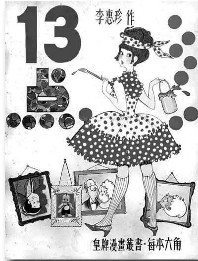
FIGURE 1. Cover of 13-Dot Cartoons , by Lee Wai-chun, issue #1, 1966.

sector, many women enjoyed the freedom of being in control of their own finances and the power to create wealth on their own. The appearance of women comic artists in Hong Kong after the Second World War began in the 1960s, at a time when a significant percentage of young women first had some personal income as well as exposure to higher education.